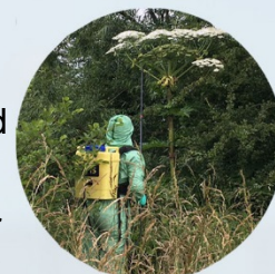
MVCP controlling giant hogweed