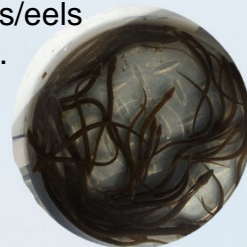
Elver catch at Allington Lock

To get in touch with the partnership please visit their website www.medwayvalley.org or their Facebook page @MedwayValley