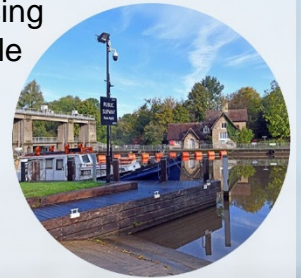
East Farleigh Lock

Earlier this year, the sluice at East Farleigh developed a fault in the gate raising mechanism, meaning that the twin gate structure can only operate on a single gate. To restore our ability to manage water levels upstream of Teston, we will be carrying out emergency works to repair the fault, and safeguard the operation of the structure for the next 5 years. We hope to carry out these works during September and October 2021, and to be off site for the winter when high flows are more likely. As the sluice reaches the end of its life, it is inevitable that it will become more unreliable and expensive to maintain, so once the emergency works are complete we will begin investigating how best to replace the sluice in the long term.